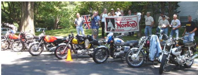
NCNO Monthly Meeting – Everyone Welcome!

British Only Motorcycles & Parts, Garden City MI: Previously huge supplier of British parts. Owners now semi-retired and $25 min order required. No frills website - you need OEM part #s. www.britishonly.com